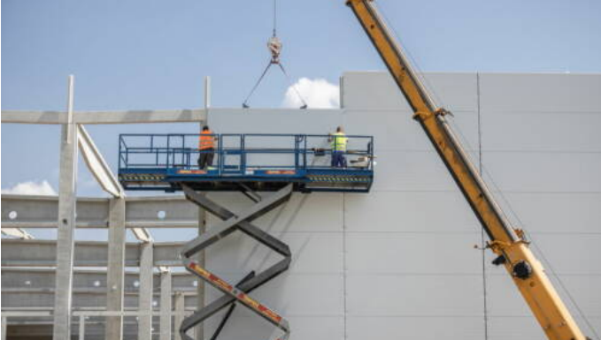
End-to-end development services including permitting, design, construction, project management, and facility management after move-in