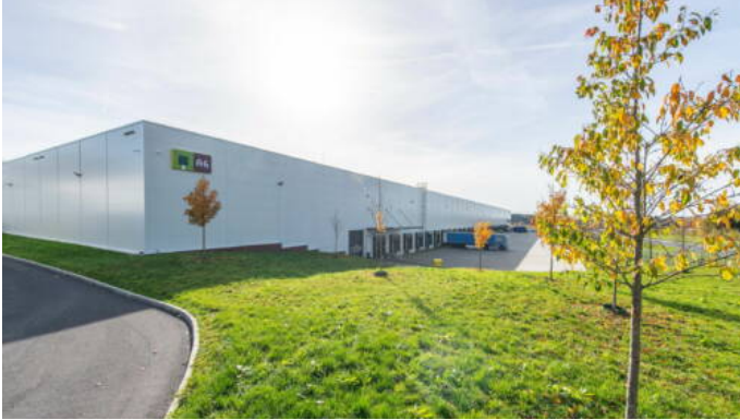
Landscaped green areas with year-round park management services