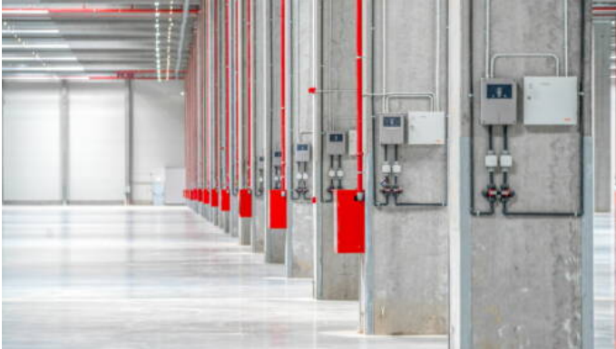
High quality standards including flexible 12x24 m grid, partition walls, sprinkler & fire safety systems, LED & natural lighting