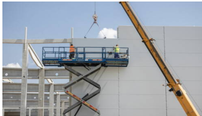
End-to-end development services including permitting, design, construction, project management, and facility management after move-in