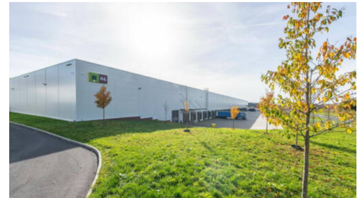
Landscaped green areas with year-round park management services