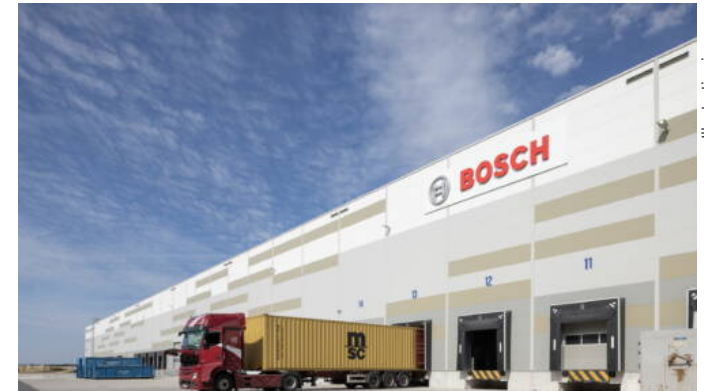
Flexible options for dock levellers and loading ramps