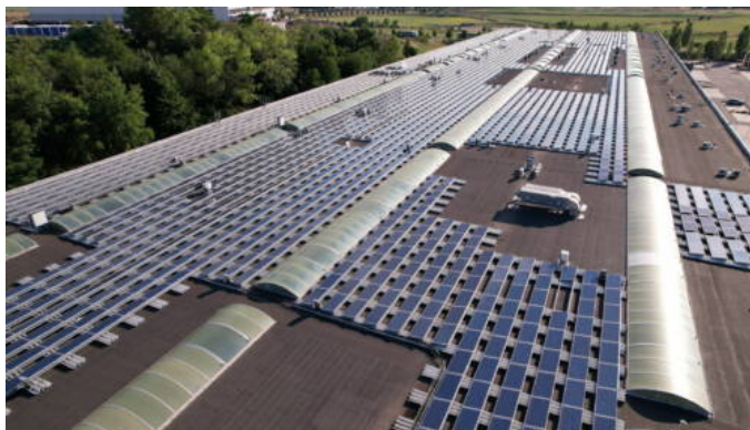
Energy efficient buildings built to BREEAM standards and high EPC ratings