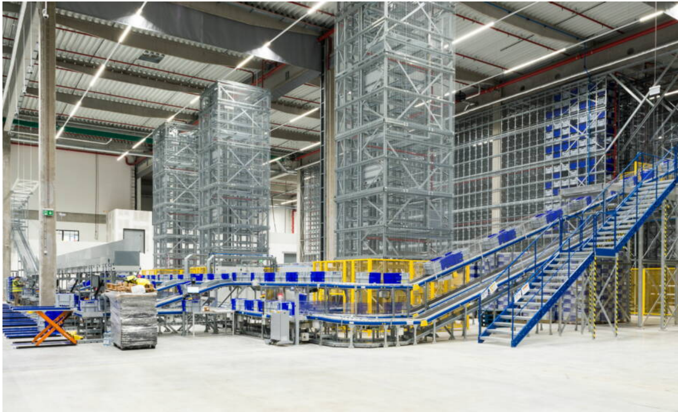
Turn-key, built-to-suit solutions to fit clients' exact requirements