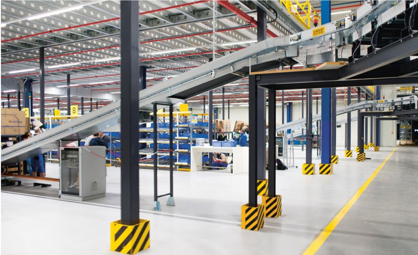
Turn-key, built-to-suit solutions to fit clients' exact requirements