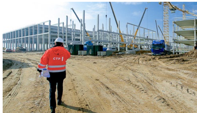
End-to-end development services including permitting, design, construction, project management, and facility management after move-in