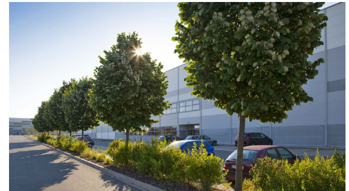
Landscaped green areas with year-round park management services