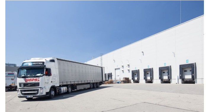
Flexible options for dock levelers and loading ramps